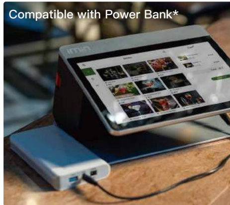
Compatible with Power Bank*