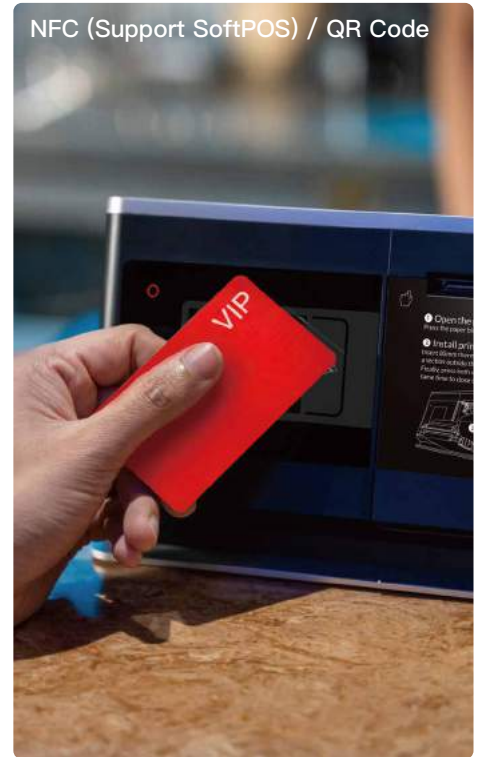
NFC (Support SoftPOS) / QR Code