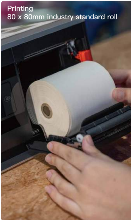
Printing 80 x 80mm industry standard roll