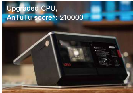
Upgraded CPU, AnTuTu score*: 210000