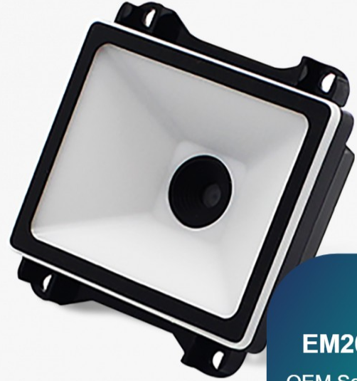
EM20-80 V2 OEM Scan Engines