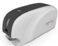
Rewritable ID CARD PRINTER smart-31 R