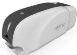
Dual sided ID CARD PRINTER smart-31 D