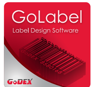
Free GoLabel label design software for ease of use and maximizing barcode printing efficiency