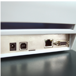
Standard with Ethernet, Serial and USB ports

Ultra-compact DT4 & DT2 are perfect for limited work spaces. Great for Retails, shipping labels, and healthcare applications