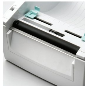
Auto switch between printer emulations (GZPL / GEPL)