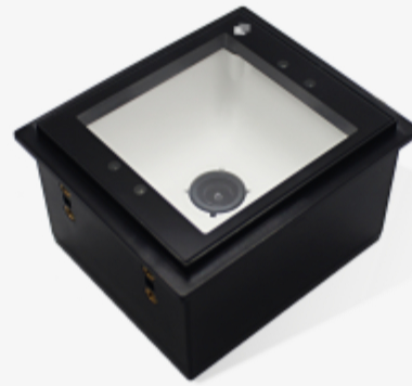
FM3080 Hind stationary scanners