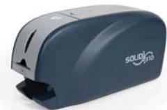
Rewritable ID CARD PRINTER SOLID-310R