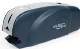
Dual sided ID CARD PRINTER SOLID-310D