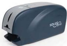
Single sided ID CARD PRINTER SOLID-310S