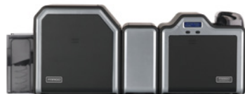
Lamination option and dual-sided printer/encoder